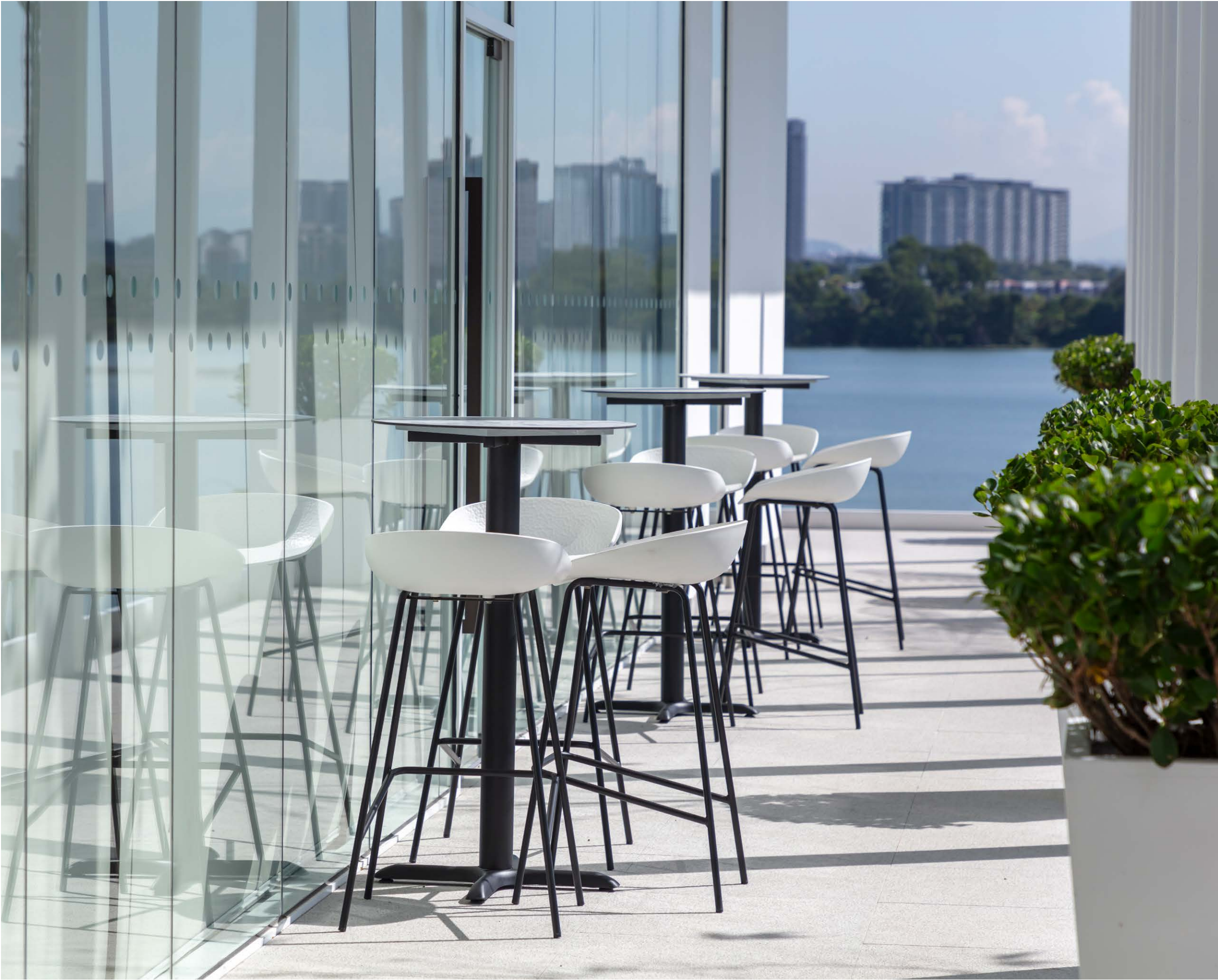
The unique urban lakeside lifestyle experience offers a rejuvenating escape from the city pace.

A home is, after all, your sanctuary, and it should feel just right from the moment you cross the threshold. As the vision for your private space coalesces, we complement thoughtful design principles with functional features as needed to make it meaningful to call your own. Everything in and around the home is interconnected, making life a breeze, as conveyed in both show units.