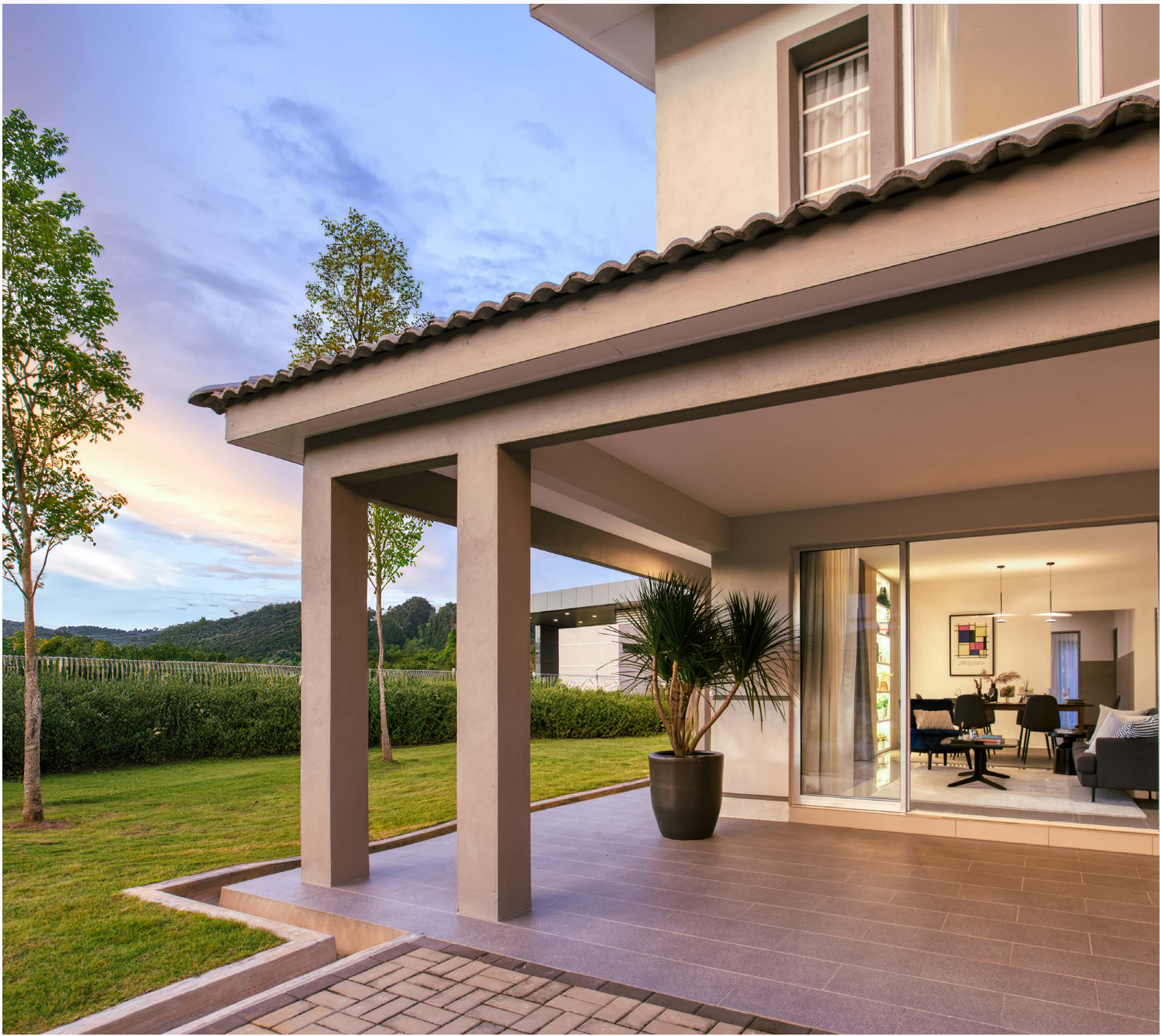
Modern urban homes at Olive Grove with built-up area starting from 2,000 sq ft and 4+1 bedrooms.

We are pleased to announce that Phase 1 of Olive Grove comprising 132 units of modern 2-storey link houses is completed ahead of schedule. The project is on target for delivery of vacant possession to homebuyers in Q3/2024.