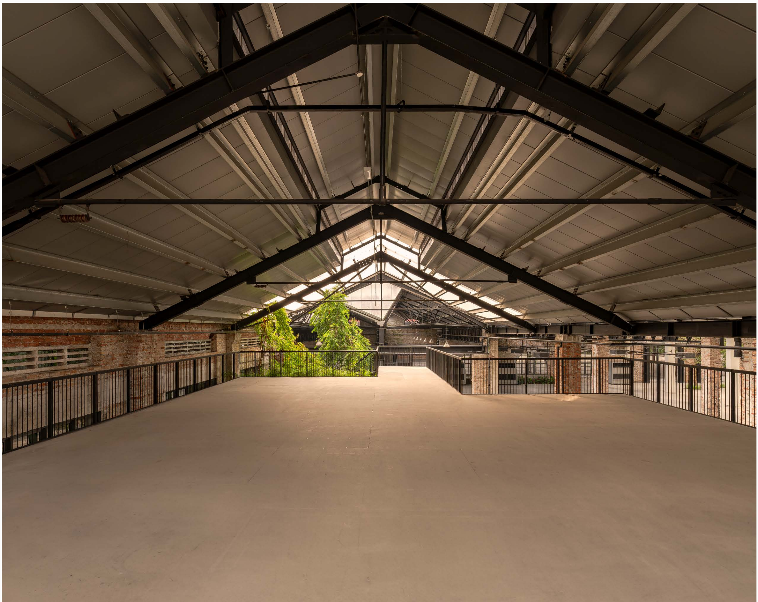
Introducing a mezzanine floor into the event space offers a blend of aesthetic appeal, versatile and innovative use of additional space, and enhancement of customer experience at The Yard.

The Yard is just as historic and timeless as the adjacent Workshops 1, 2 and 3 that surround it. The independence and individuality of The Yard as one of the event spaces yet interconnected with the other workshops allows opportunities for additional space and creative configuration to meet specific needs of events.