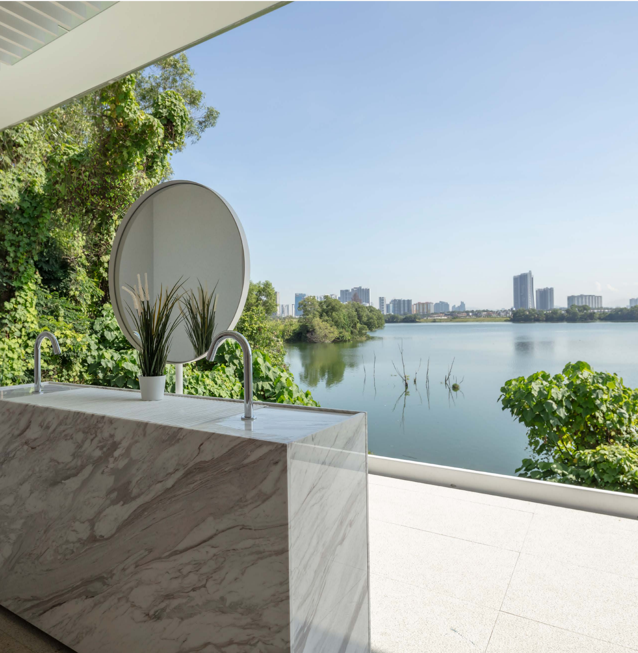
At Danau Puchong, comfort is having the calm of green surroundings and the serenity of a tranquil lake as your backdrop.

A fulfilling modern urban lifestyle isn't complete without convenient access to the best amenities that the neighbourhood has to offer. Danau Puchong's strategic location not only puts it minutes away from a host of dining, entertainment, retail, healthcare and education options within the vicinity. Its proximity to two LRT stations—IOI Puchong Jaya LRT Station and Pusat Bandar Puchong LRT Station—also means residents will enjoy seamless and reliable access to major hotspots and destinations within the Klang Valley integrated rail network.