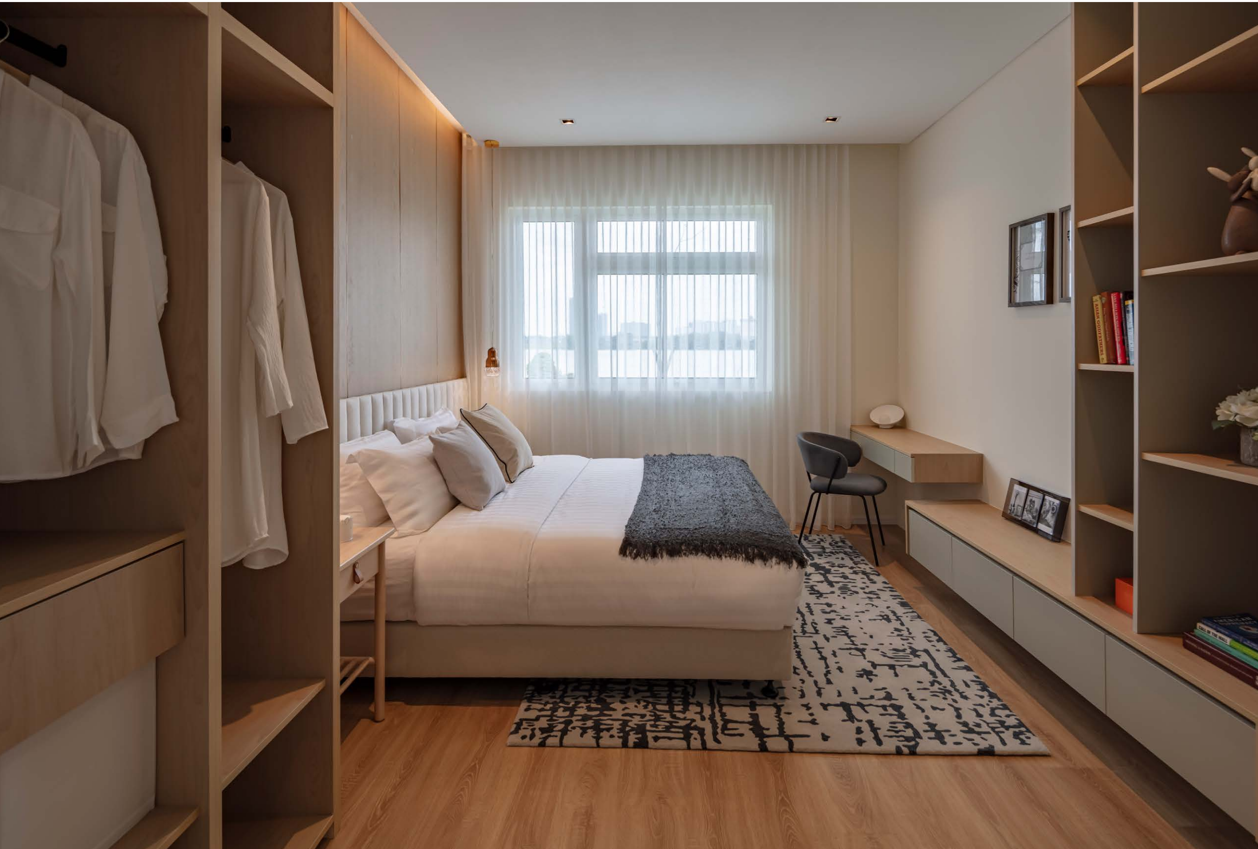
The inviting atmosphere of the open-plan space flows into the spacious master bedroom that can be easily configured to suit diverse aesthetic and lifestyle preferences.

The open concept flows into the living area which enjoys the view of the outdoors. Freedom of movement between the kitchen, dining and living area creates a greater feeling of expansiveness provided by full-height sliding glass doors looking out to a vista of the lake and a panoramic view of the urban skyline.